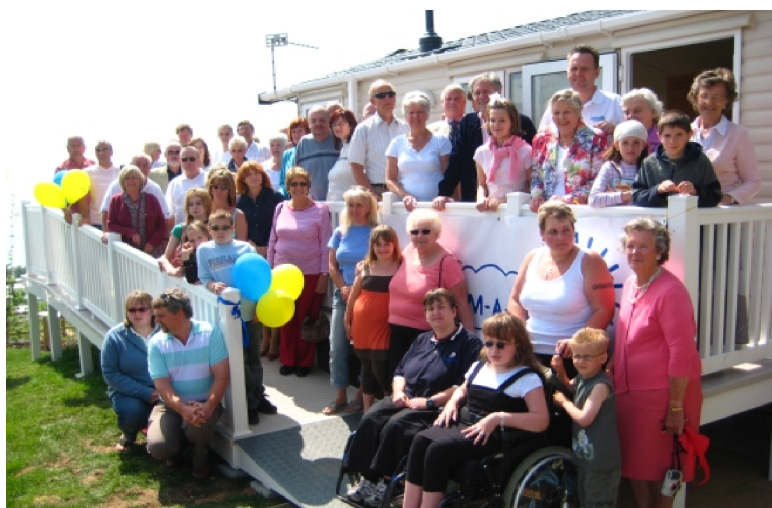
Supporters at the opening of 'Gemini Dream' in 2007